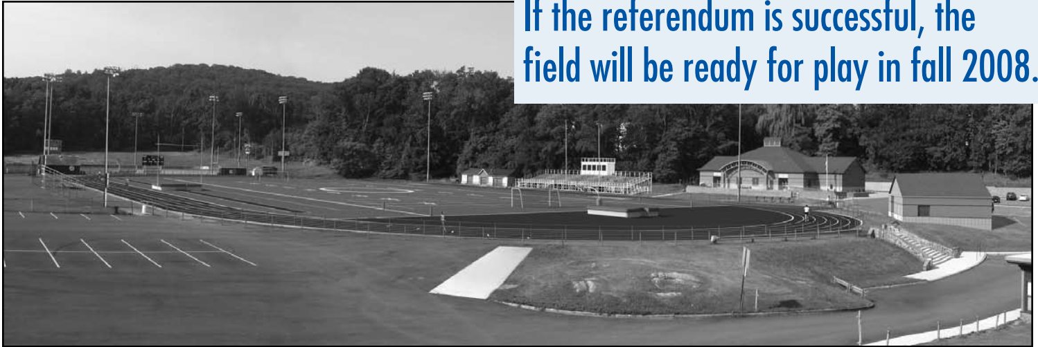
An architects rendering of the proposed upgrades at Memorial Field.

If the referendum is successful, the field will be ready for play in fall 2008.