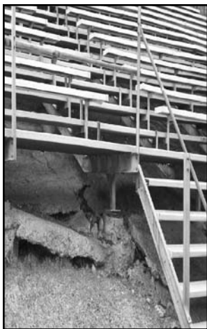
Deteriorating bleachers were removed from Hempsted field in June.

On September 25, 2007, the board of education will ask Butler residents to vote on a field upgrade referendum. The proposal calls for the installation of bleachers and a new multi-purpose turf field as well as lighting, a six-lane, all-weather track, and concession stand with rest room facilities at the Memorial Field location.